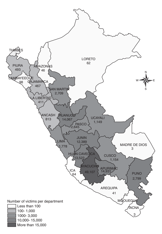
Figure I: Map showing violent incidences - number of official victims per region. Huancavelica: 13,523

in the health or the educational system over the whole region, and a very low demand for care limited to some psychosocial problems presenting to rural health posts (family disputes caused by alcohol consumption, school failure in children, suicide attempts and teenage pregnancy). These cases were referred via primary care. The PeruvianTruth and Reconciliation Commission (in Spanish: Comisión de la Verdad y Reconciliación (CVR)) (June 2001–28 August 2003) proposed a Comprehensive Reparations Plan (Plan Integral de Reparaciones in Spanish) that was mostly not met, but that